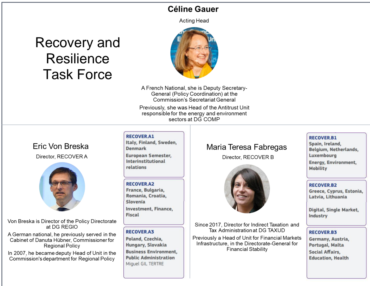
Figure 3: Recovery and Resilience Task Force